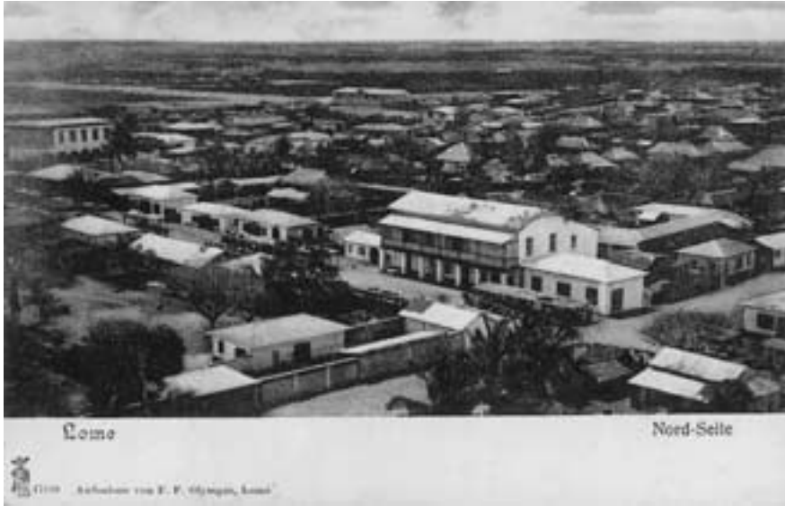
PICTURE 3. — “Carte postale”, produced by Fabriano Francisco Olympio, depicting Lomé under German colonization. Photo taken from the bell tower of the Lomé Cathedral, ca. 1905.

were under his auspices in Lomé. He was called Tافيانو (a corruption of Octaviano) by the Hausa (Sebald 1988: 68, 71; Agier 1983: 65, 67).